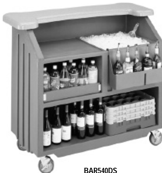
BAR540DS (Shown with 5-bottle Speed Rail)